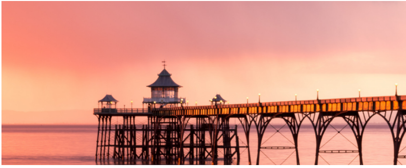
Clevedon Pier, thought to be in 1950s and today

Built in 1869, Clevedon Pier is the only Grade 1 listed pier still standing in the UK; it was described by poet John Betjeman as “the most beautiful pier in England”. Located on the eastern shore of the Severn Estuary in the charming seaside town of Clevedon, Somerset, it was originally constructed to attract tourists and to provide a ferry port for rail passengers to South Wales. It also served as an embarkation port for paddle steamer excursions for almost 100 years, as seen in the photograph on the left, above. It faced demolition in 1970, when two of its spans collapsed during stress testing, but local fundraising and heritage grants allowed it to be restored and reassembled, reopening in 1989. Now safely standing once again, it offers a popular attraction for tourists - anglers enjoy using it, and paddle steamers still call at the pier head. There’s an excellent visitor centre and museum featuring the pier’s heritage, award-winning food and drink from the Pagoda Café and a new fish restaurant, plus a unique porthole room from where you can view underneath the pier – the only pier in the UK where this is possible.