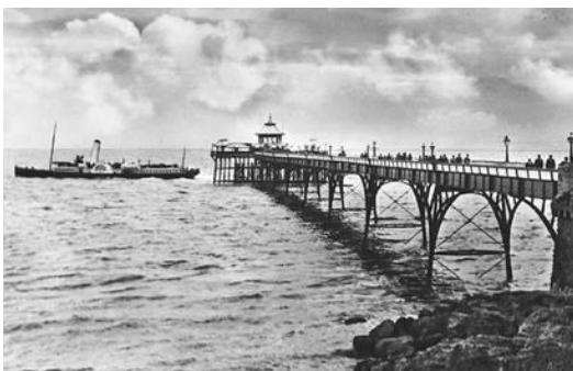
Clevedon Pier, Somerset