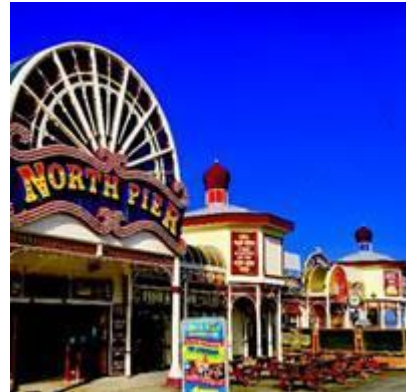
Blackpool North Pier c1930s and today

Blackpool is the only town in the UK to boast three piers. The oldest, Blackpool North, was built in 1863 by Eugenius Birch, the most prolific and celebrated pier engineer. With a wide strolling deck, theatre and pier-end carousel, it has retained much of its original Victorian architecture, but now also has a new “Insta envy” gin bar, Bloom , offering superb views of the coast, tower, and Blackpool’s other two piers. Central Pier, built in 1868, was designed after the success of the first, but with a new emphasis on fun rather than genteel relaxation – provided in the early days by dance halls, roller skating, fairground rides and amusement machines, which were then adapted to become a theatre, bars and amusement arcades in the 1970s. The South Pier, formerly called the Victoria Pier, opened in 1893, and is today a family-friendly venue with live entertainment, a beer garden and amusement arcade.