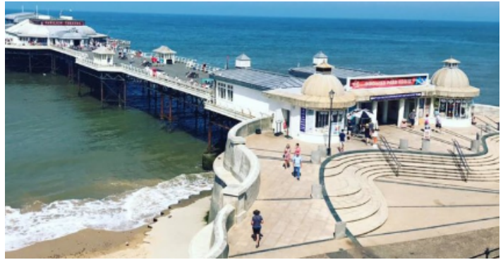
Cromer Pier c1930 and today

A Grade II listed pier in Cromer, on the north coast of Norfolk, Cromer Pier was originally built as a jetty in 1822 and has undergone various redesigns over the years. As a jetty in the 19 th century, it became popular for promenading, and a keeper was employed to keep order – rules included ladies having to ‘retire’ by 9pm. It has won the Pier of the Year award twice (voted by National Pier Society members), boasts the excellent Tides Restaurant and is home to a Pier Theatre, which hosts the only remaining summer ‘end of the pier’ variety show. It’s also a great spot for crabbing and hosts the annual Cromer and Sheringham Crab and Lobster Festival on August Bank Holiday Weekend.